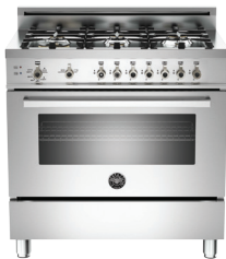
Any model and size